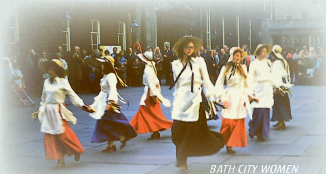
BATH CITY WOMEN

Co-hosts of The Women's Morris Federation first AGM in Bath, 1975.