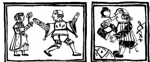
Morris Music - A History or Whatever did the old dead guys ever do for us?